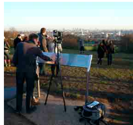
View from Assessment Point 2A.2 Parliament Hill: the summit - looking toward the Palace of Westminster (at the orientation board). 527665.4E 186131.5N. Camera height 98.10m AOD. Aiming at Palace of Westminster (The Central Tower, above the lobby crossing). Bearing 158.6°, distance 7.1km.