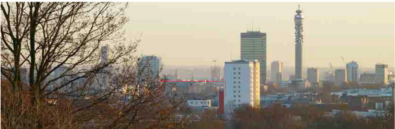
Telephoto view of Protected Vista from Assessment Point 2B.1 to Palace of Westminster