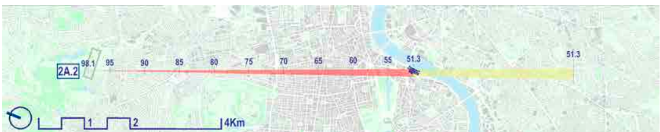
Annotated map of Protected Vista from Assessment Point 2A.2 to Palace of Westminster