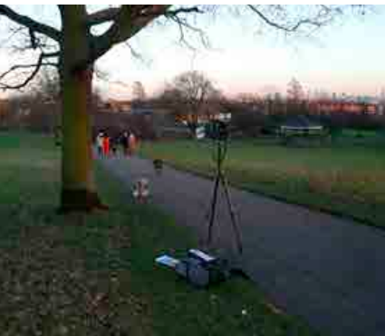
View from Assessment Point 2B.1 Parliament Hill: east of the summit – at the prominent oak tree (Alongside prominent oak tree). 528043.1E 186154.5N. Camera height 71.61m AOD. Aiming at Palace of Westminster (The Central Tower, above the lobby crossing). Bearing 161.6°, distance 7.0km.