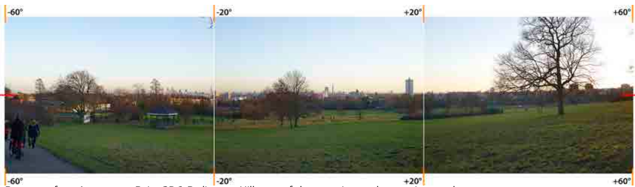
Panorama from Assessment Point 2B.1 Parliament Hill: east of the summit – at the prominent oak tree