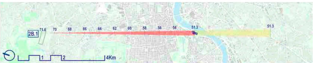
Annotated map of Protected Vista from Assessment Point 2B.1 to Palace of Westminster